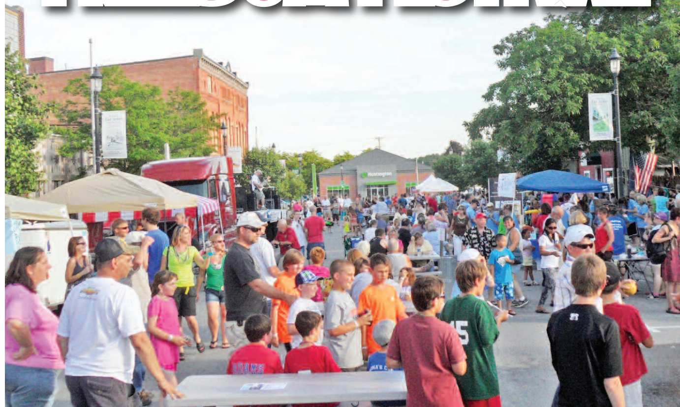
The 2017 Freedom Festival in East Jordan begins June 24 with the Jordan Valley Triathlon, and continues through July 2 with a huge celebration featuring carnival rides, a block party, drawings, a grand parade, prize raffles, fireworks and more.

The 2017 Freedom Festival in East Jordan begins June 24 with the Jordan Valley Triathlon, and continues through July 2 with a huge celebration featuring carnival rides, a block party, drawings, a grand parade, prize raffles, live music, fireworks and much more. It's an amazing week of excitement for those of every age and interest, set in the beautiful community of East Jordan.